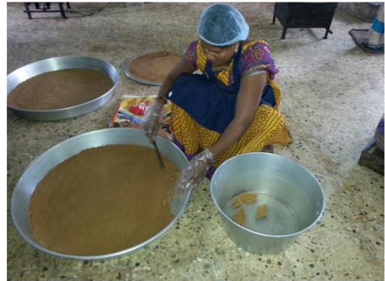
Helper & Water Bearer Providing water & Hand wash liquid to wash hands